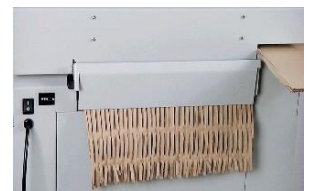
PROTECT YOUR OBJECTS, ensure safe transportation.