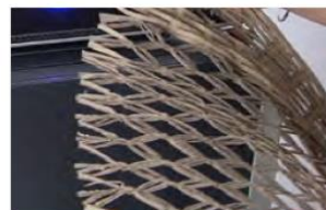
TRANSFORM USED CARTON INTO HIGH QUALITY PACKAGING MATERIAL