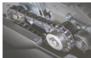
SUPER POTENTIAL POWER UNIT: chain drive system with steel gears.